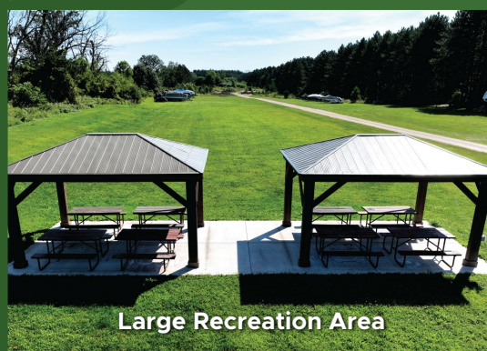
Large Recreation Area